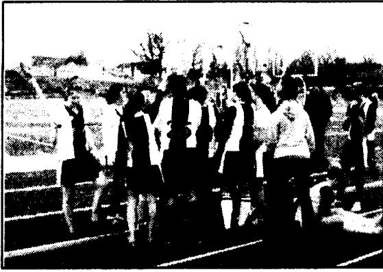
The Behrend Lacrosse club huddles during a game.