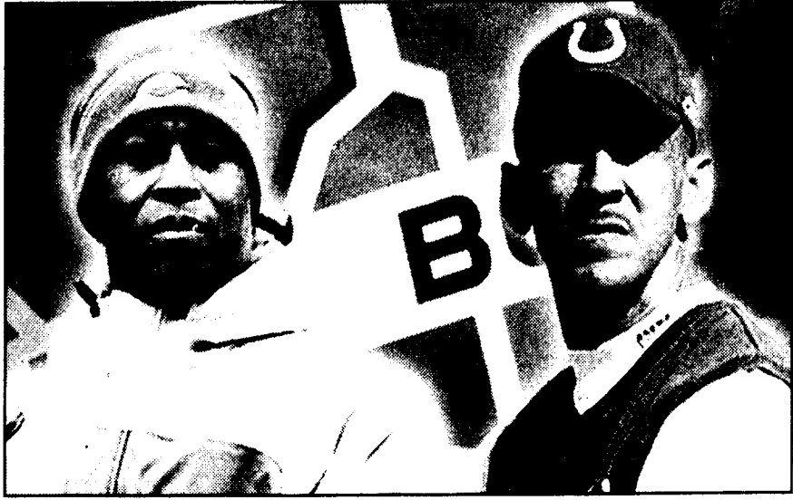
Coaches Smith and Dungy are the first African-American head coaches in the NFL to take their teams to a Super Bowl.

England Patriots fought hard for the AFC title. The Patriots scored the first points of the game when running back Laurence Maroney fumbled a hand-off from quarterback Tom Brady, which was recovered by offensive lineman Logan Mankins in the end zone for a touchdown. The Colts answered this touchdown with a field goal, making the score 7-3 in the first quarter.