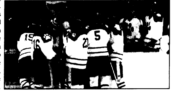
Behrend hockey players huddle during a recent game.