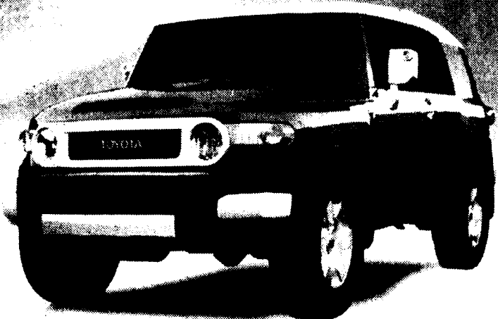
2007 FJ CRUISER