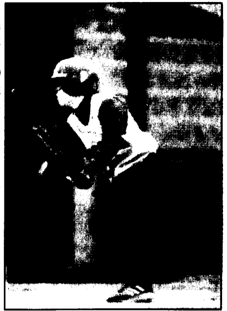
Sophomore Nikki Kaschauer is up to bat.