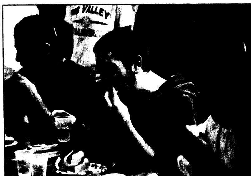
Hot dog anyone?