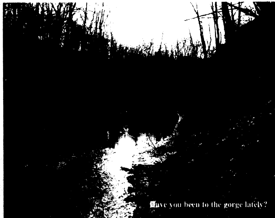
Have you been to the gorge lately?