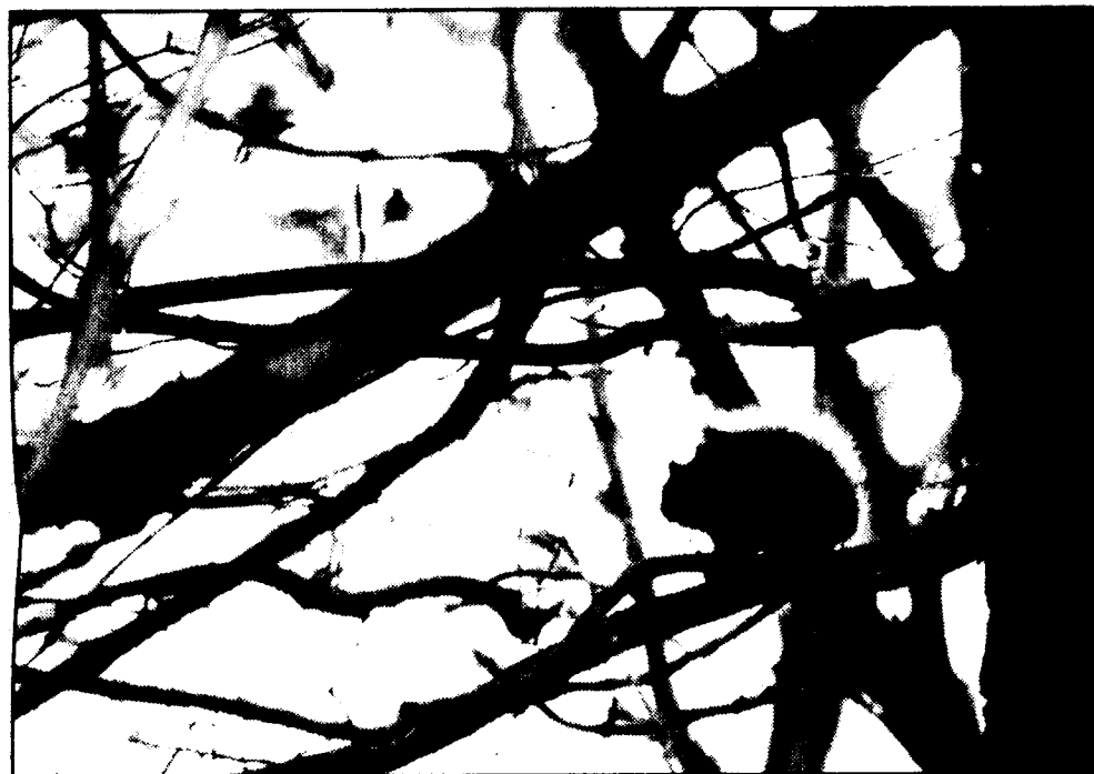
Chip or Dale? You make the call...