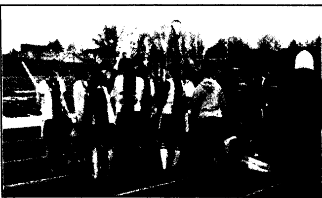
The Behrend Lacrosse club huddles during a game.