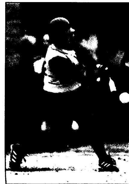
Behrend batter connects with a pitch.

"We played really good team softball. We just communicated well and