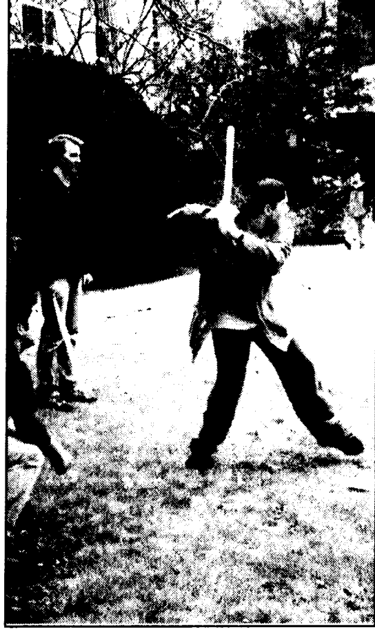
Wiffle Ball is quickly becoming the new hotness contributed photo

Wiffle ball has the unique ability to bring people of all skills together. It takes a great amount of talent to hit a 90-mile an hour fastball, but almost anyone can hit a floating wiffle ball.