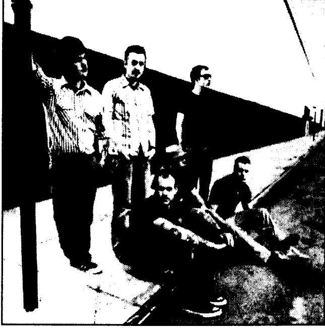
Modest Mouse's new album We Were Dead... is in stores now

Going back to their dark and melodic ways Modest Mouse returns with a new offering called We Were Dead Before the Ship Even Sank . Not much has changed from Modest Mouse's last album Good News For People Who Love Bad News . They have kept their over-the-top sound and production quality intact. The word play is just as dark and eccentric as last time around but this time Isaac Brock lets himself go just a little further lyrically with lines like "If you think you know enough/ to know you know enough you've had enough/and if you think you don't/you probably will." The album is riddled with these types of tongue twisters.