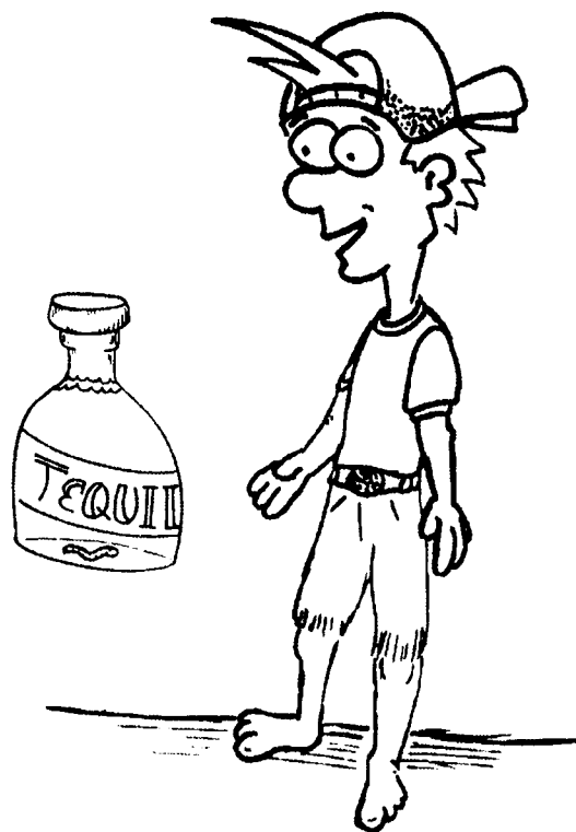
Hey! I brought you a souvenir.