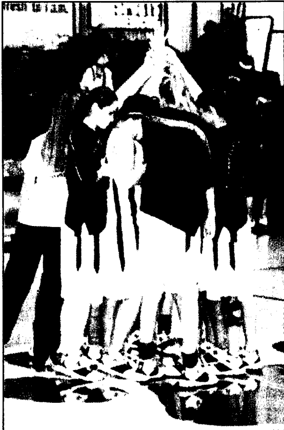
The team huddles before a recent game.