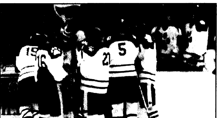
Behrend hockey players huddle during a recent game.