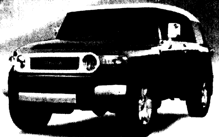
2007 FJ CRUISER