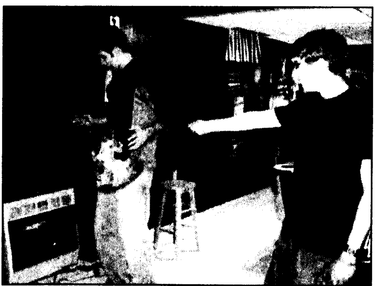
Dorm life can be hazardous to your health.

If you do manage to make time for laundry the heater in your room is not and should not be used as a dryer. The fire department might not take you seriously when you say your pants are burning.