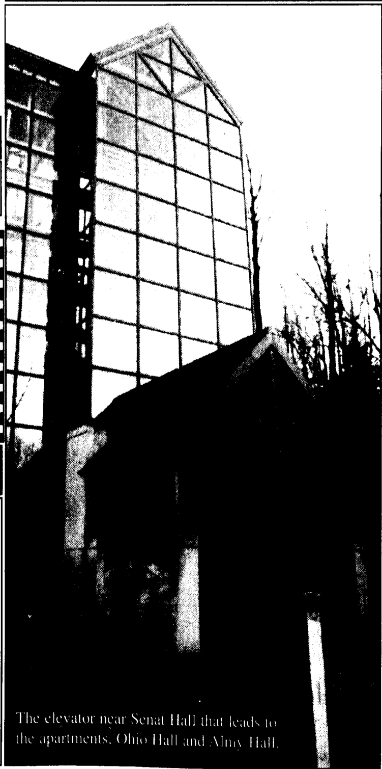
The elevator near Senat Hall that leads to the apartments, Ohio Hall and Almy Hall.