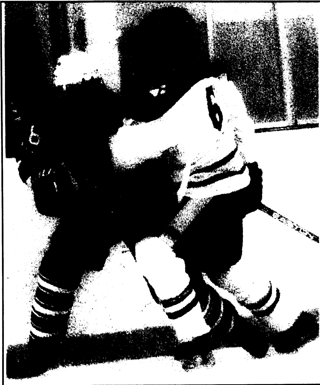
Behrend lions start season strong as tournament champs