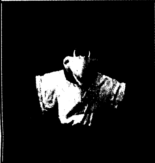
The Fighting Blue Hen

2) University of Delaware, Fighting Blue Hens