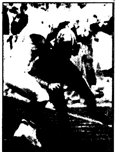
Vanderbilt Quarterback Jay Cutler