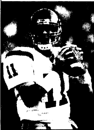
USC Quarterback Matt Leinart