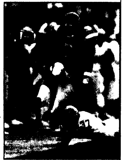
USC Running Back Reggie Bush