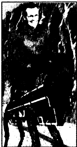
Rumsfeld rides Big Dog ~Page 6