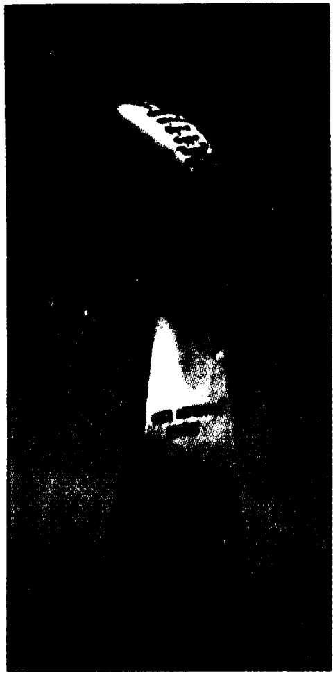
The Pittsburgh Steelers won their fifth Lombardi Trophy with a 21-10 victory.