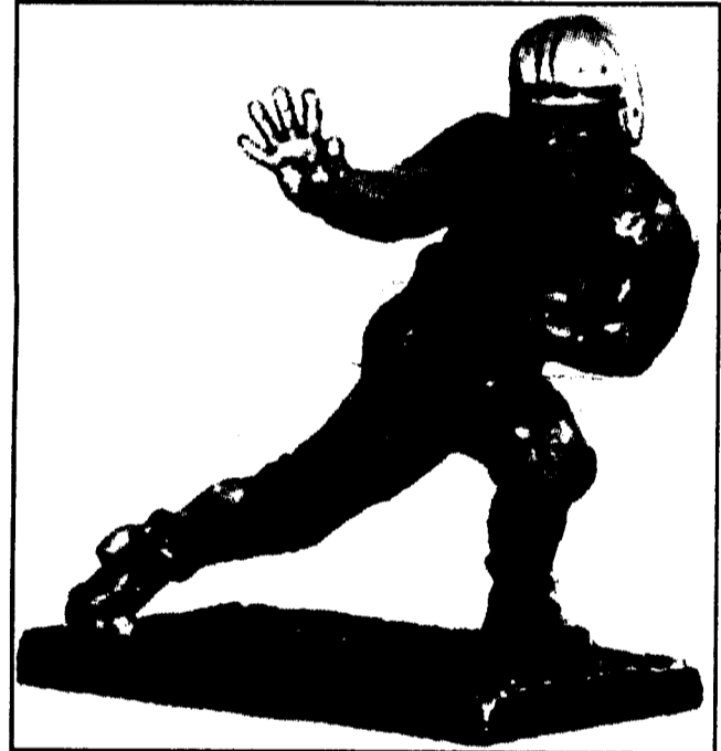
College football's most elite player will be chosen for the Heisman Trophy this weekend in New York City.