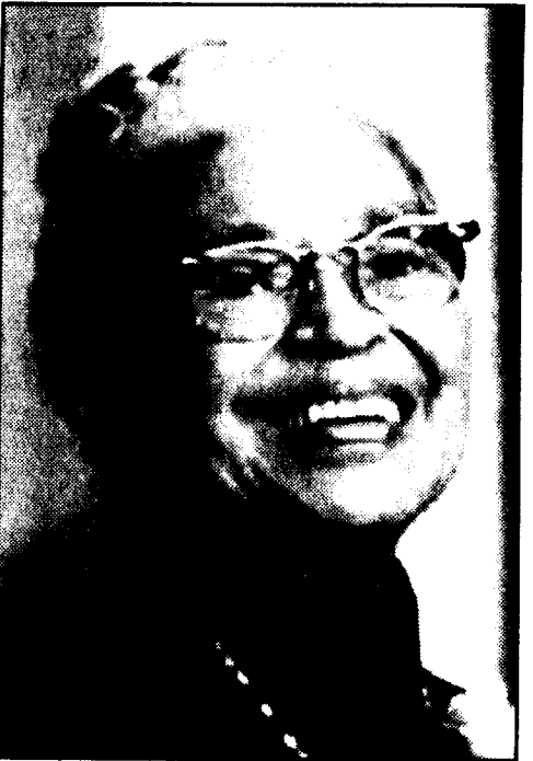
Civic rights icon, Rosa Parks, 1913-2005

from this period in history. The outcome of Rosa Parks' actions has helped to pave the way for not only previous generations but also for the generations to come. The world as a whole has come a long way from what it was before. We are one step closer to what Rosa Parks and other civil leaders like herself had envisioned in the past. History is important because people should not repeat the mistakes of the past. Thanks to Parks contributions, the only steps we have left to take are the ones moving forward.