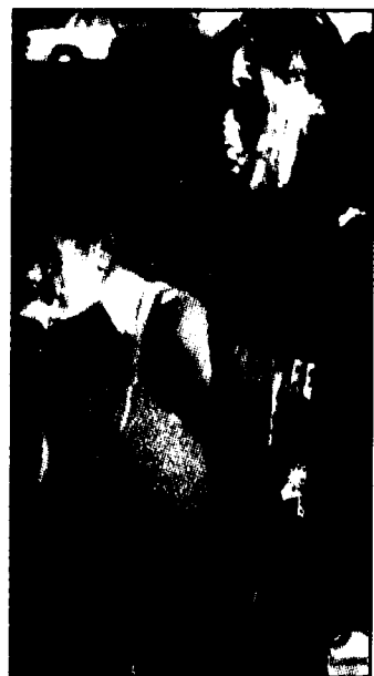
RAs get pied, page 7