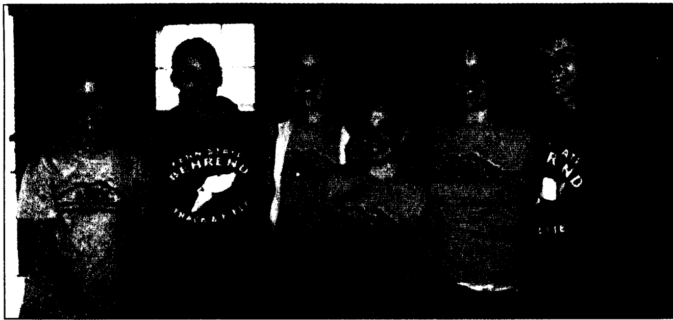
The 2004 women's cross country team and AMCC Champions.