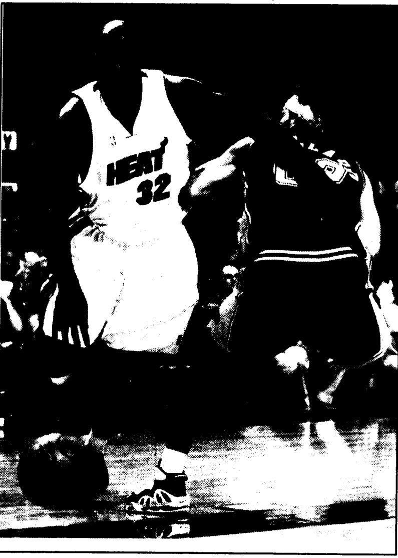
Shaquille O'Neal's Heat are the number one seed coming out of the East.

Miami and Phoenix have played to well this season and should not be impaired on their journey. Duncan and San Antonio will take Phoenix to seven games, but fall short due to the dominance of Amare Stoudemire and the passing precision of Steve Nash. As well as Detroit has been playing, the Heat may have too many weapons for their defense to handle. That is why I predict that Miami will prevail until the Finals. Phoenix is the most exciting team to watch. They can outrun teams in transition and score in the paint. If Shawn Marion and Stoudemire can keep Shaq from getting the ball, the Suns shall reign supreme. If this can happen, the Phoenix Suns shall be the 2005 NBA Champs.