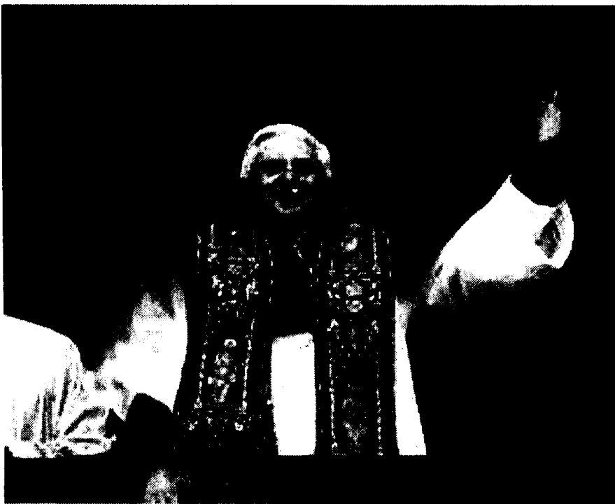
Pope Benedict XVI is looked on as he looks on.

Vote in our online poll at : www.whitehouse.gov