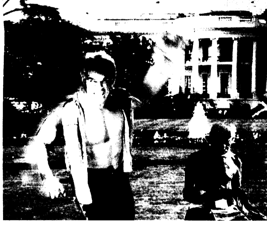
The Incredible Hulk and Gandhi meet for a nuclear proliferation summit on the south lawn of the White House. Due to the reasonable amount of time Gandhi spent evaluating the summit white paper, the Incredible Hulk became irate, emitted a guttural Hulk 'smash' and enacting his method of resolution upon Gandhi.