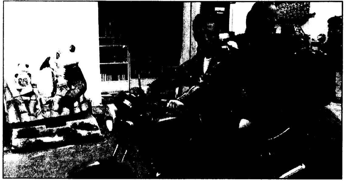
Catalina Sandino Moreno plays 17-year old Maria, a teen who decides to smuggle cocaine pellets in her stomach to earn money to care for her unborn child in Joshua Marston's "Maria Full of Grace."

Sandino Moreno's performance is rare and emotionally evocative. The harrowing tale of a 17-year-old mule is tragic enough, but with her sensitive portrayal, the small moments captured by Marston's camera push the boundaries of our own understanding of the human condition. Sandino Moreno's con-