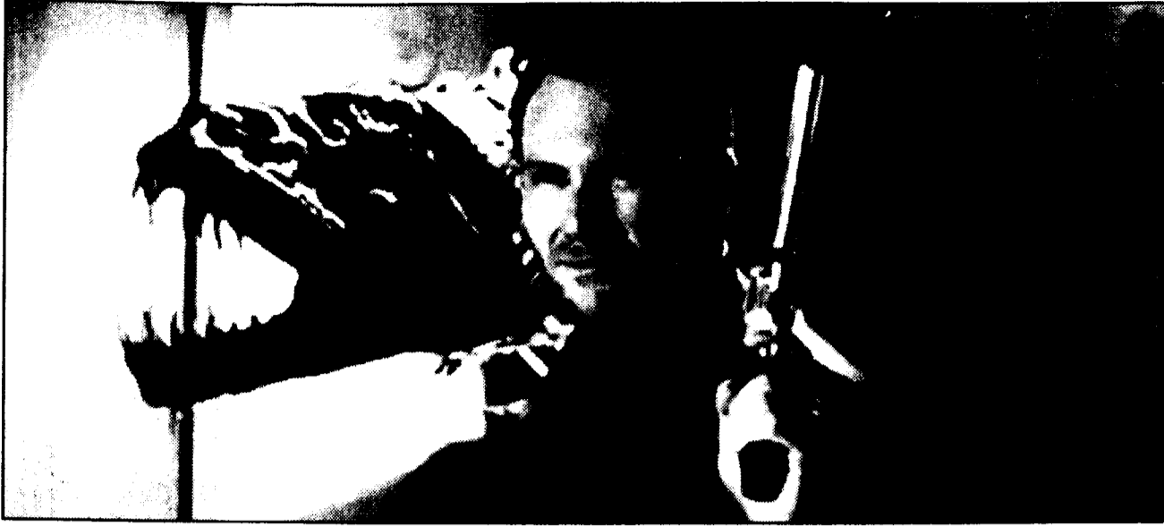
Christian Slater go, go, goes in "Alone in the Dark."