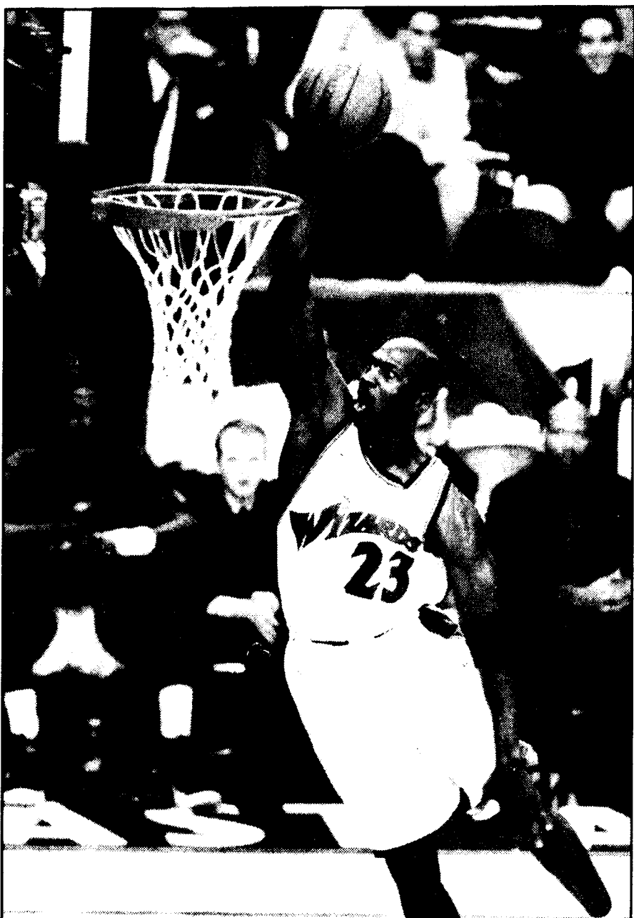
Eastern Conference All-Star Michael Jordan dunks one-handed during the NBA All-Star game in Philadelphia on Feb. 10, 2002.

The list of Jordan's accomplishments is almost endless. Jordan won the NBA's Most Valuable Player five