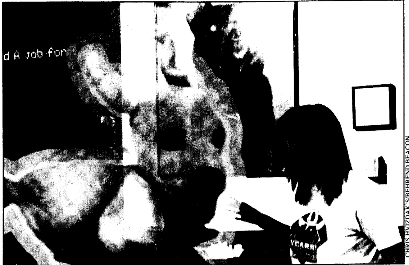
Ghost of Bruno terrorizes Bruno's. The spirit of the fabled canine for which the campus cafe was named has recently spooked up quite a commotion by frightening students who approach the condiment cart. The Behrend family was unavailable for comment.