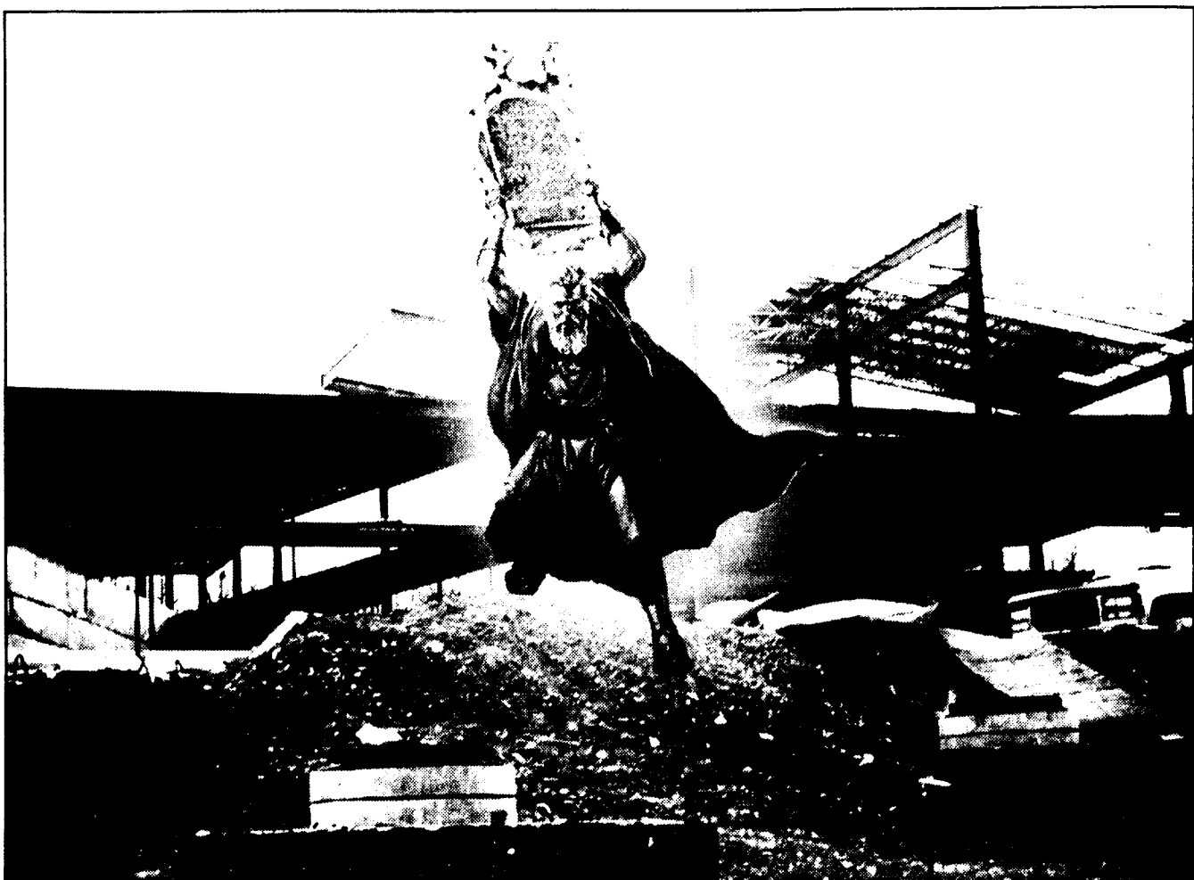
Moses parts REDC; construction delayed at least 40 days and 40 nights.