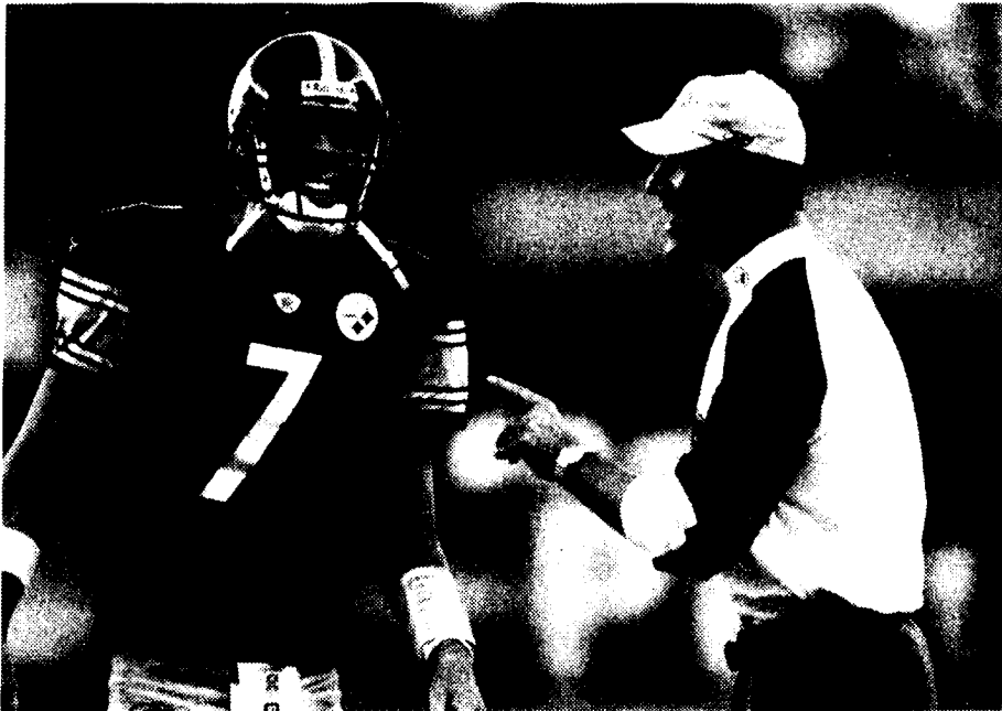
Pittsburgh Steelers quarterback Ben Roethlisberger laughs as Steelers Head Coach Bill Cowher gives him instructions during a sideline conference late in the game against the Philadelphia Eagles. The Steelers defeated the Eagles 27-3 at Heinz Field on Nov. 2.