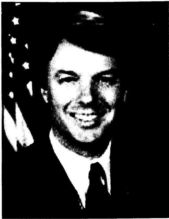
Sen. John Edwards