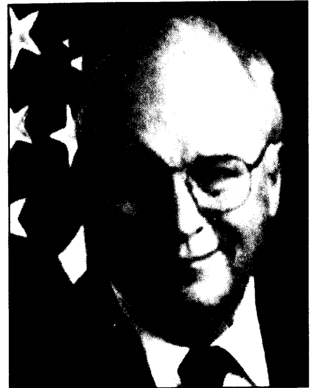
Vice President Dick Cheney