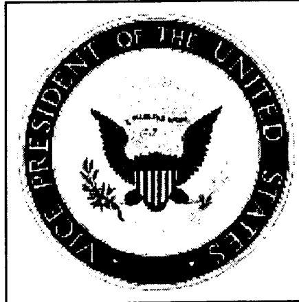
Vice Presidential Candidates stances on the issues

The United States Constitution assigns the vice president only two official duties: presiding officer of the Senate and to be prepared to take office in the event of the president's death, inability to execute his duties, resignation or removal from office.