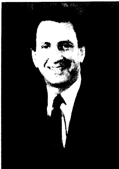
Arlen Specter (R)

Arlen Specter supports affirmative action, civil unions, more federal funding for health care coverage, immigration, United Nations approval for US military actions, reduction of coal, oil and nuclear energy usage, enforcement of laws prohibiting drug use, expansion of free trade, privatization of social security, the death penalty and the right to firearm ownership.