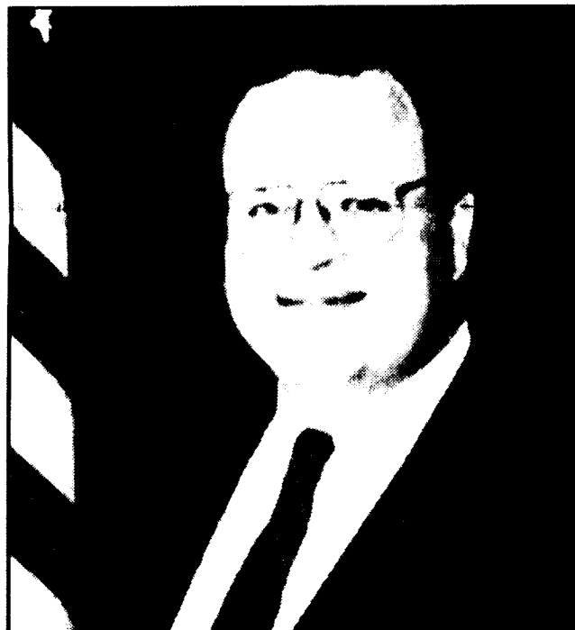
Republican candidate Phil English