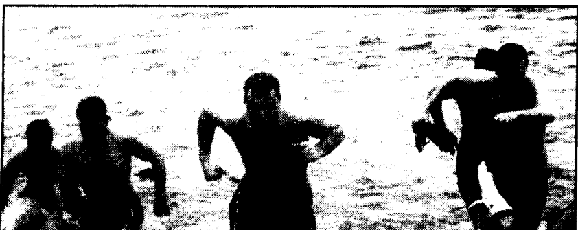
TKE brothers run out of the freezing waters of Lake Erie during the Ice Plunge, held annually in April. The Ice Plunge raises money for the fraternity's philanthropy, the Reagan Alzheimer's Association.

The brothers will also be holding their annual Ice Plunge in the spring semester. In the middle of April, the TKE brothers will jump into Lake Erie and all the money they raise benefits the Ronald Reagan Alzheimer's Association.