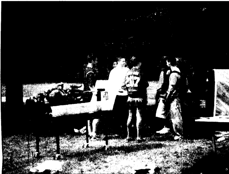
Delta Chi brothers are planning on holding the eighth annual pig roast this fall. Last year's event was a huge success for the organization.

The chapter is growing bigger each and every year, and as a result, the brothers are gaining more and more experience on what it is like to be involved in an international brotherhood of men.