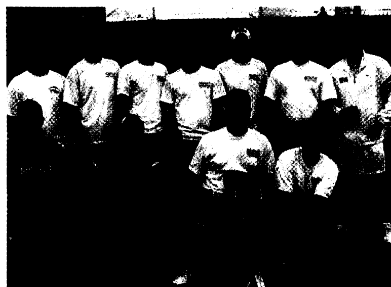
The Lions entered the AMCC tournament with a perfect 6-0 con- o to have to play harder at ference record. They are also currently tied for the all-time wins in a single season record at 14 wins this season.