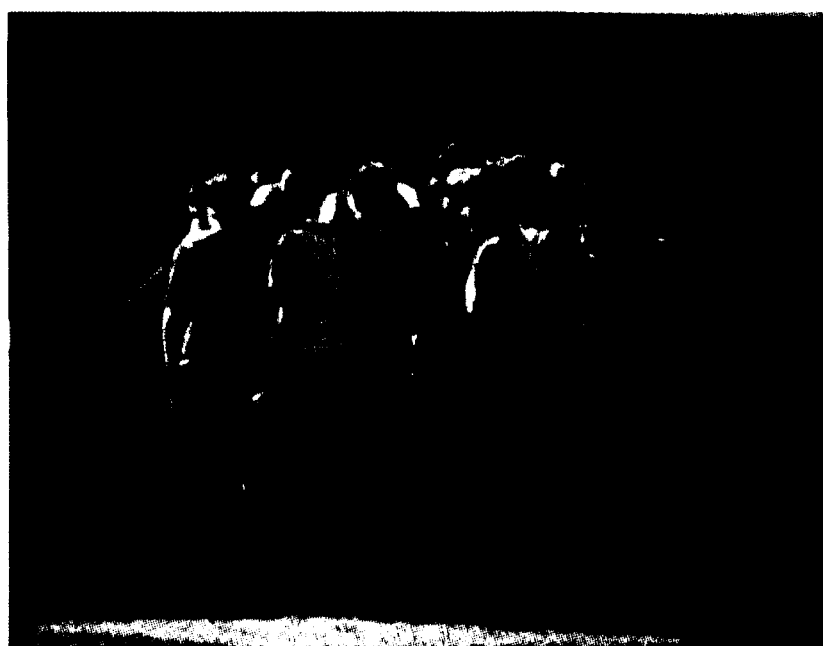
The softball team now posts a 6-18 record including a 5-3 conference record, which has put them in the No. 1 spot. The team is looking to maintain its position as it fights for the AMCC championship crown.

The two nonconference losses dropped the women's record to 5-17 but did not affect the team's conference standings. It remains in first