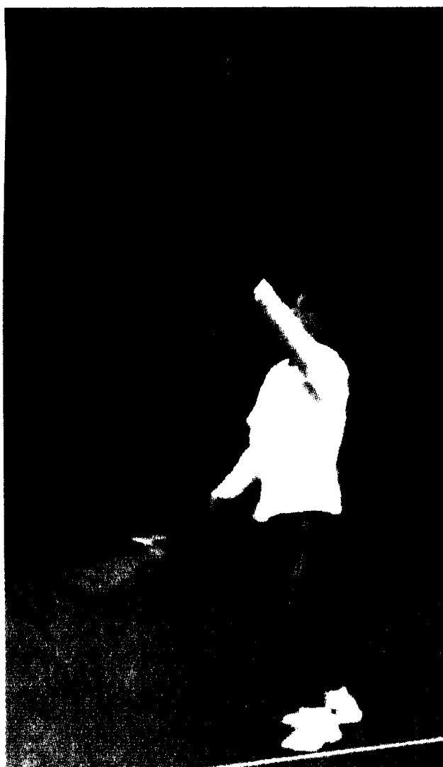
The tennis team finished conference play with a perfect record of 6-0. It will next play in the AMCC tournament on Saturday.

The men haven't done much to change their game plan before AMCCs.