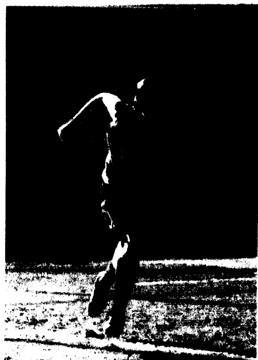
The Lady Lions will have to hustle to stay in the No. 1 spot for the AMCC tournament.

On Wednesday, Behrend traveled to Westminster for a double-header against the Titans. The Lions lost a close one to Westminster in