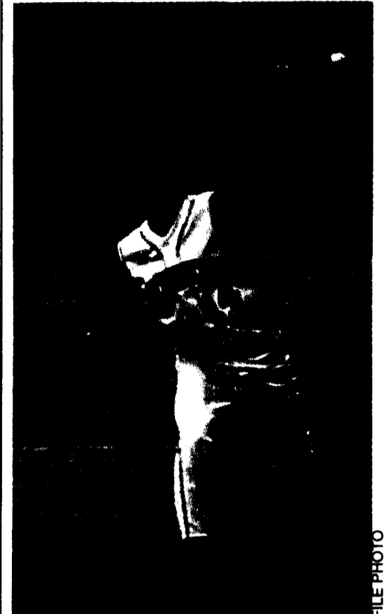
The baseball team is currently 2-4 in the AMCC after splitting a doubleheader at Pitt-Bradford on Wednesday.