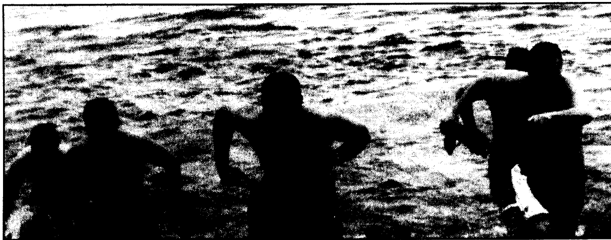
Brothers of Tau Kappa Epsilon jump into Lake Erie to raise money for the Ronald Reagan's Alzheimer's Foundation.

On March 27, the brothers will hold their second annual "Ice Plunge" which benefits the Ronald Reagan Alzheimer's Foundation. The active chapter will be diving into the freezing waters of Lake Erie to raise money for this cause. During last year's event alone, the fraternity raised close to $3,000. This year, they plan on exceeding that figure and making the event bigger and better. It will be an all day event with a variety of refreshments included. Brothers will be