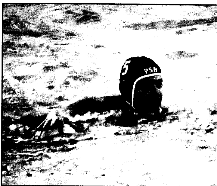
The Lions ended their season with a record of 4-25.

As expected, the team faced Grove City in a crossover game. The