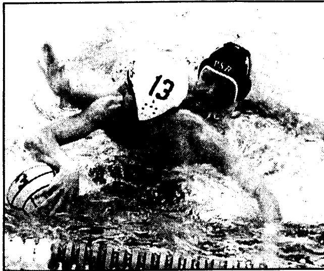
Men's water polo avenge loss to Mercyhurst.

Fittingly, their last two games of the season came in the form of a twin bill against Mercyhurst and