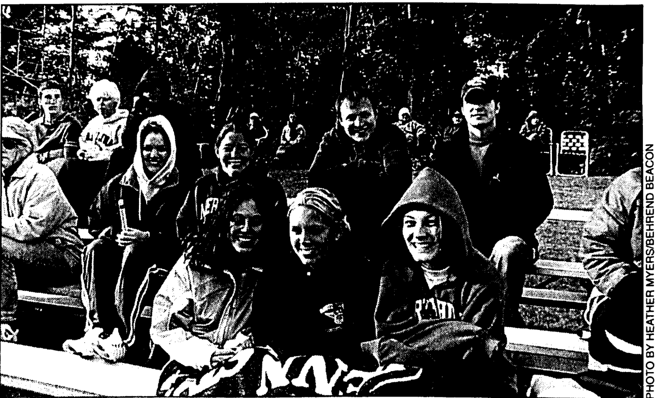
Soccer fans brave the cold weather and support the Lions on the first day of October against the Grove City Eagles.