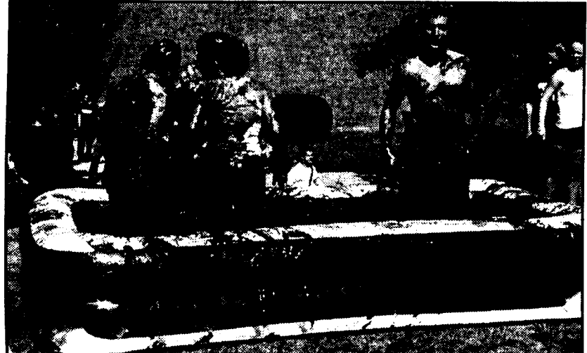
Above, Behrend Greeks showed solidarity during Greek Week. They showed their competitive sides while displaying their prowess at pudding wrestling (left) and truck pulling (below).