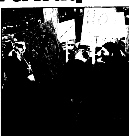
Calls for peace were heard in downtown Erie on Monday, Oct. 7, 2002. About 400 people gathered in Perry Square to protest the possible United States invasion of Iraq. The rally was organized by local college students and religious groups.