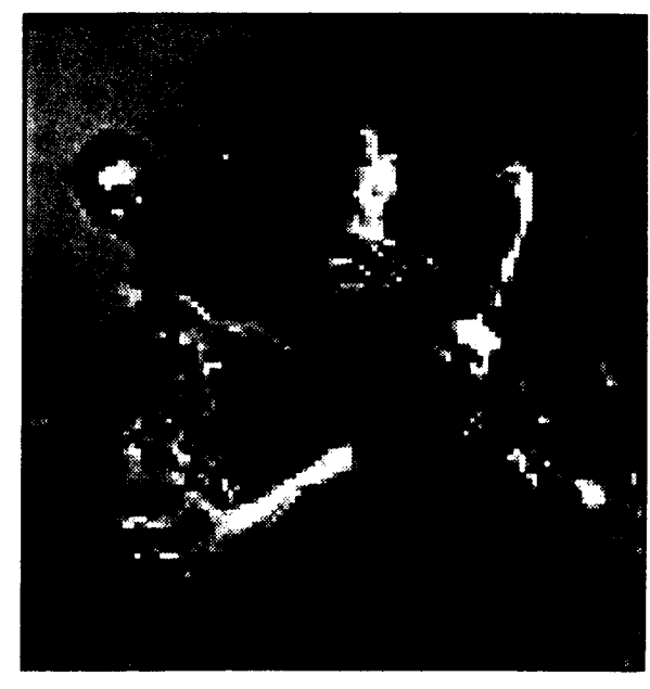
The Turtle Island String Quartet closed out the Music at Noon series for the year. Since it first formed in 1986, TISQ has been a powerful force in creating daring new trends in chamber music for strings. The ensemble fuses classical quartet artistry with modern popular styles. The group has explored such genres as folk, bluegrass, swing, jazz, be-bop, classical Indian forms, rhythm and blues, new age, hip-hop, and bossa