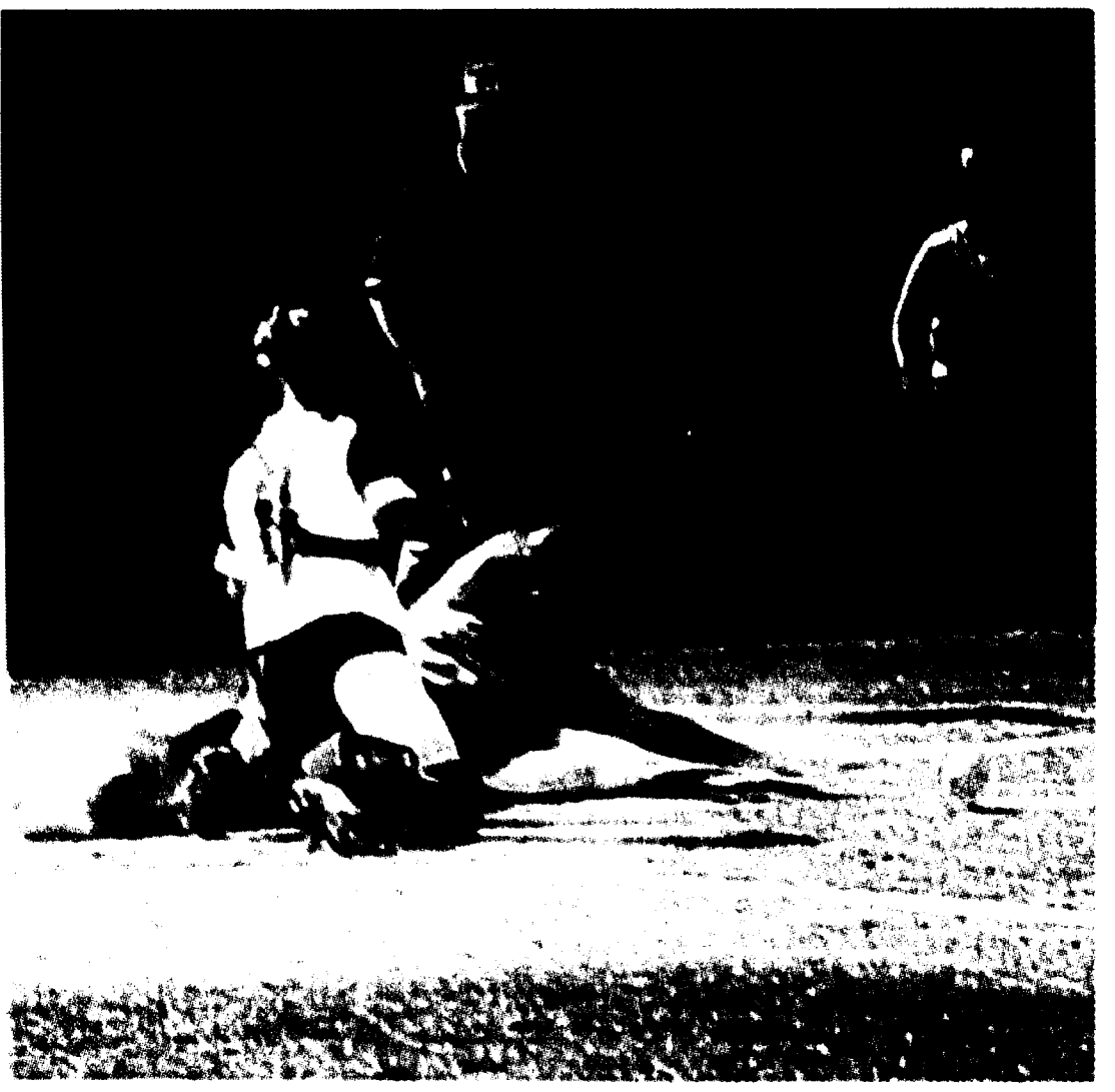
Captain Cheryl Peterson lays it all out for a hard earned run.