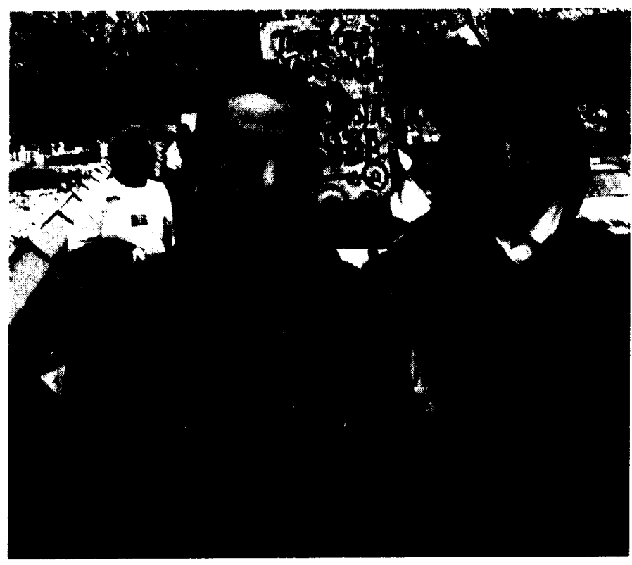
Demonstrators, including many Behrend students, speak out against violence and sexual assault at the annual "Take Back the Night."