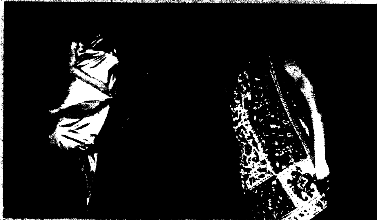
Behrend students show the international side of fashion during Thursday's fashion show.

Students strut their stuff during annual ABC show