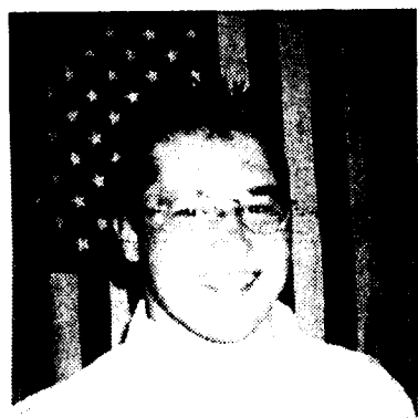
Look, here's how it is Guy Reschenthaler

The global community should rally with France and let the French gov-