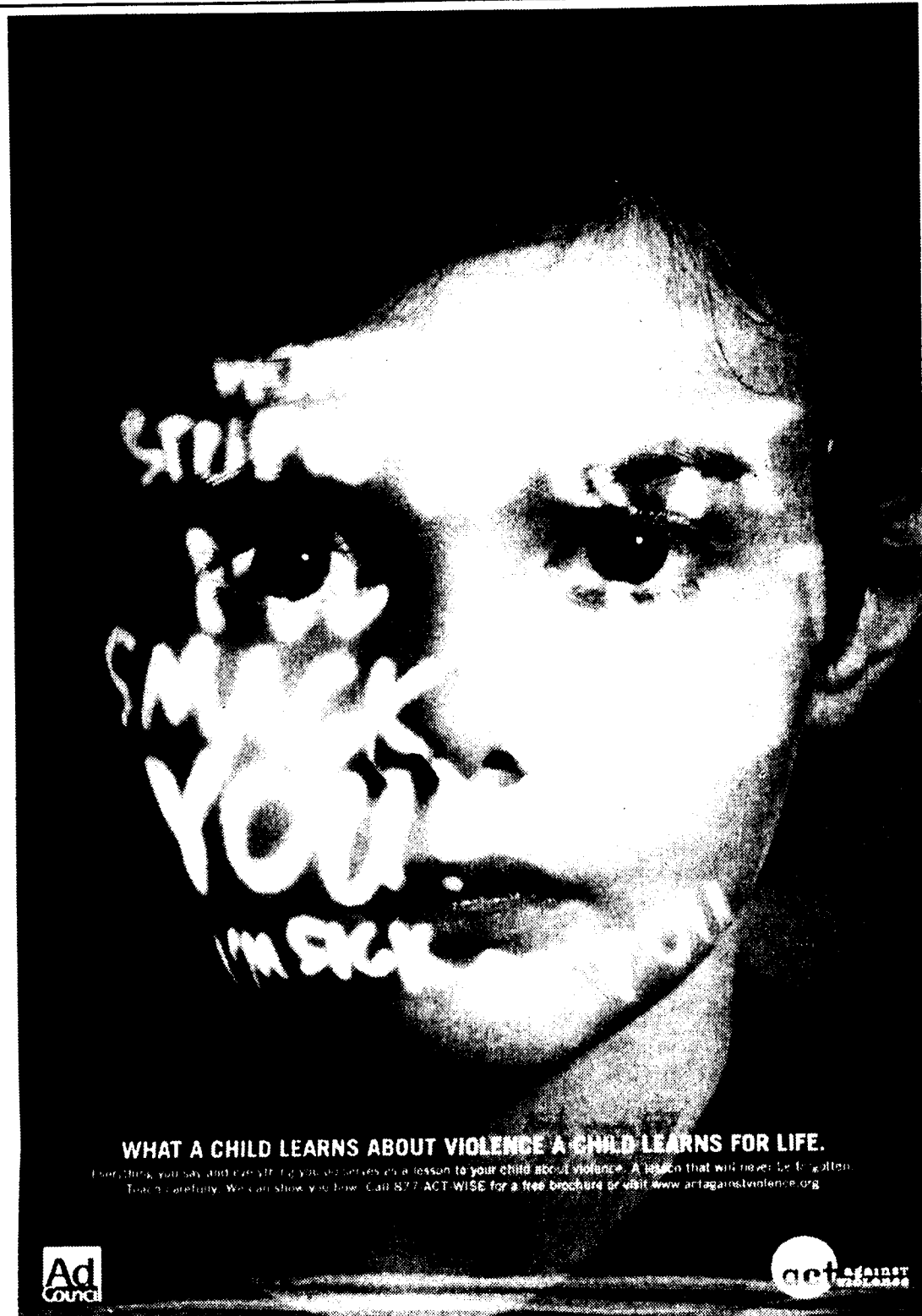
WHAT A CHILD LEARNS ABOUT VIOLENCE A CHILD LEARNS FOR LIFE.

Information about the national Tuba Fest is on the web at www.tubachristmas.com .