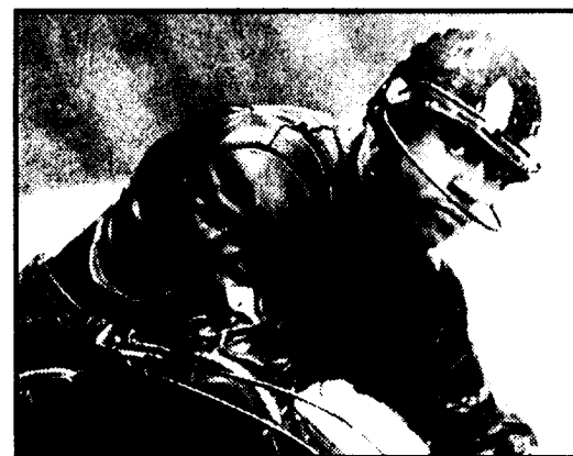
LL Cool J takes one for the "Rollerball" team.

After moving the release date back nearly six months, MGM finally released the sci-fi remake "Rollerball." The film was butchered (quite obviously, I might add) to get a PG-13 rating, making it the worst film of the year.