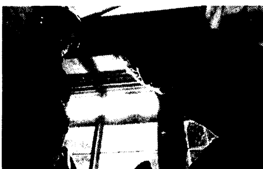
Cruise catches another pre-criminal in "Minority Report."

There are still a number of upcoming releases with a ton of potential, but I doubt any of them will be able to top "Minority Report." Steven