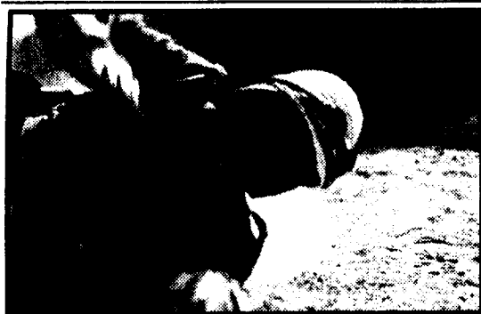
Wes Bentley falls flat, like "The Four Feathers."