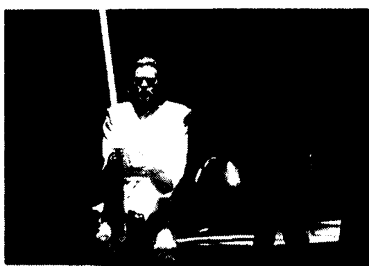
Even the Jedi couldn't save "Attack of the Clones"

just that reason. With its B-movie action, crude script, and brainless characters, "XXX" was the movie equivalent of prostitution (and that is not a critique of the awkward sex scenes). Even worse, "XXX" has condemned Vin Diesel to forever face comparisons with Sylvester Stallone and Arnold Schwarzenegger when his performances in "Saving Private Ryan" and "Boiler Room" prove he's more than a set of pecs.