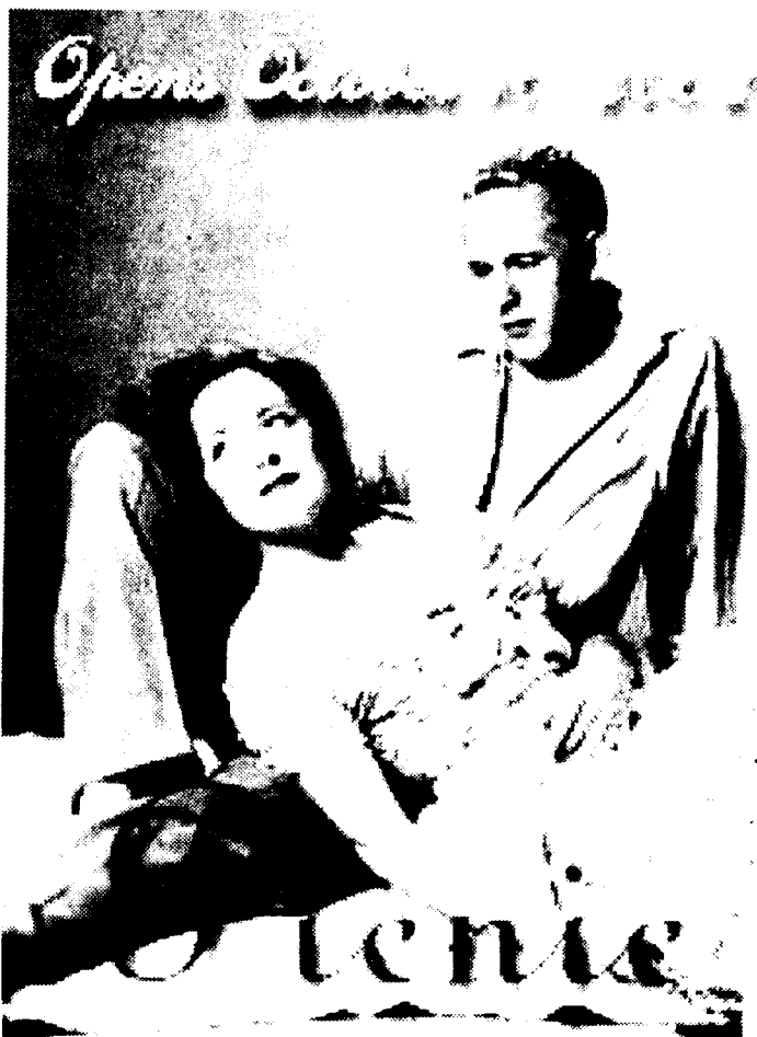
"Picnic," will be playing until October 27, 2002 at the Erie Playhouse.

performances is surprisingly impressive and ticket prices are reasonable ($10 per student). Go out and experience something cultured, something of substance. Anything important. Do it for the sake of a future generation that may very well include alcoholics and closed-minded underachievers who have never read a book for pleasure, or watched a film with subtitles ("Crouching Tiger Hidden Dragon" doesn't count).