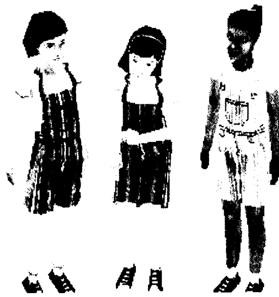
A few Sims pose in their favorite threads.

"It's a guy thing, but yet it's a woman who hosts the site that has these love beds."