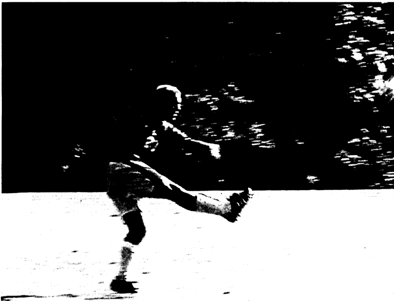
Goalkeeper Jake Hordych has been a wall, allowing only two goals in the past two weeks. He is back-to-back AMCC Goalkeeper of the Week.