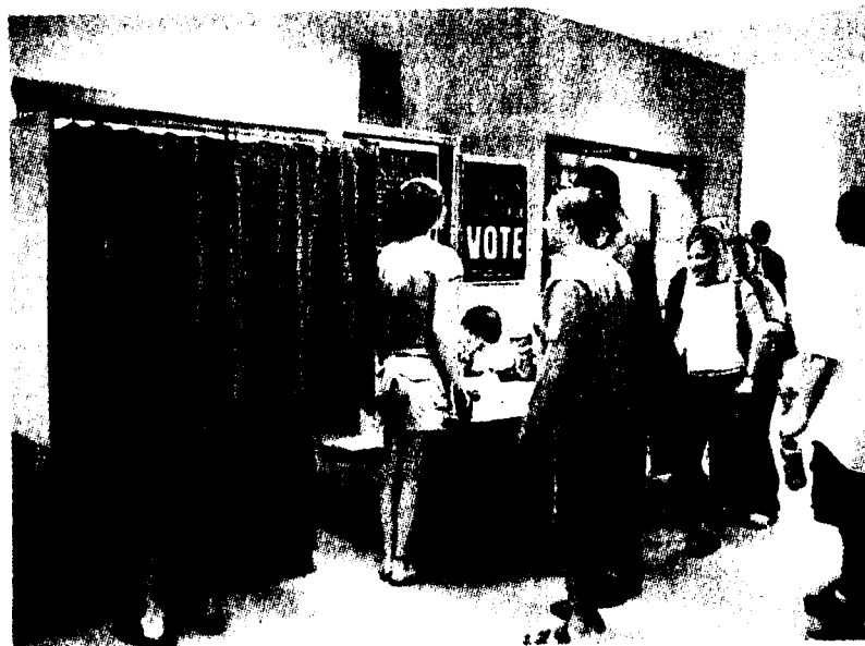
SGA had an outstanding voter turnout this year with a total of 556 students participating, a number up significantly from last year's turnout of 316.

Students elected will begin their terms at the beginning of the fall 2002 semester.