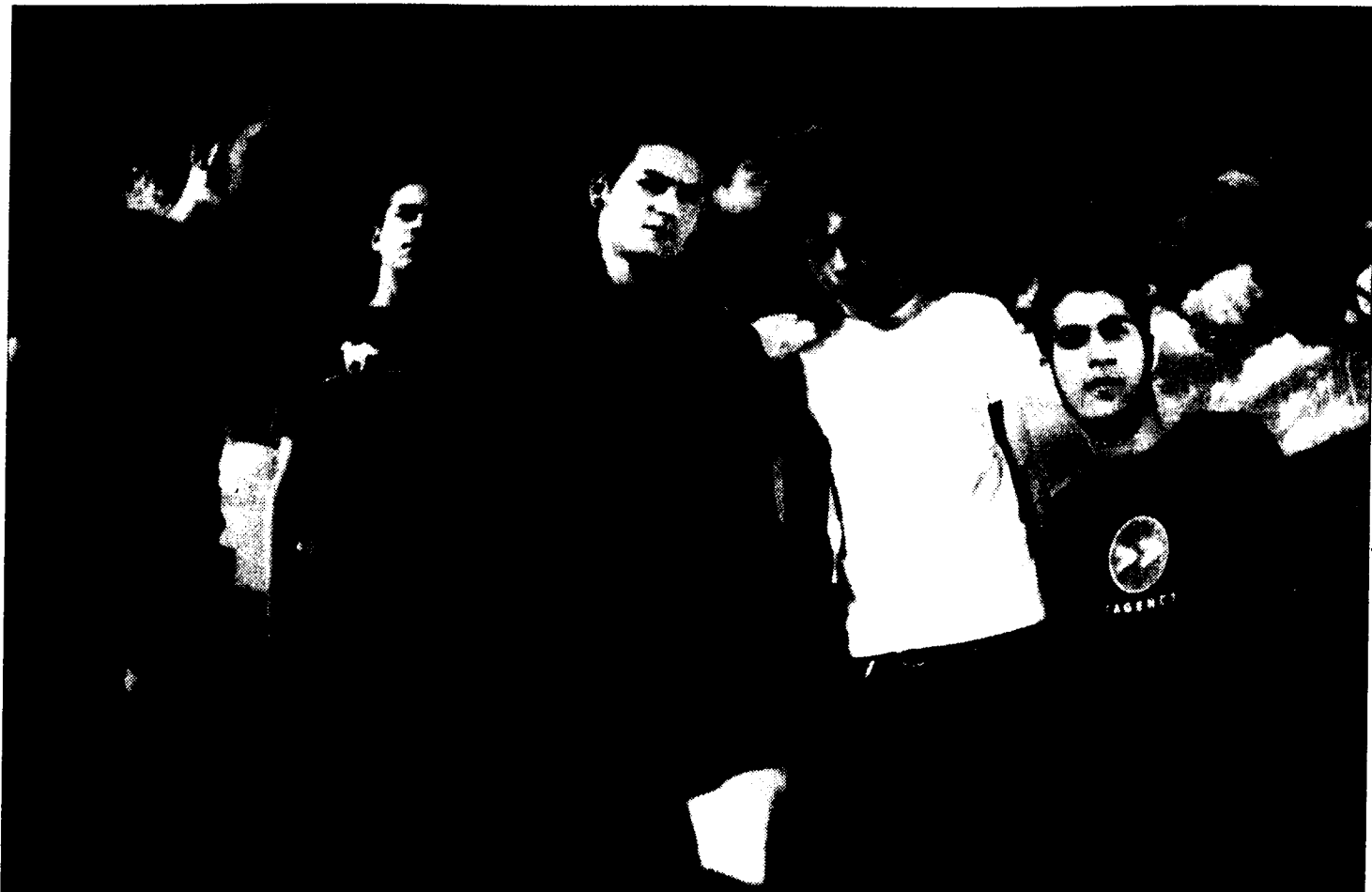
The members of Poison the Well pose for the camera, making sure to smile on the inside.

The first time Poison the Well played in Erie a few years ago, it was before a crowd of about 15 people. The empty room didn't faze the band members; they played with the same emotion and energy that currently has them packing venues.